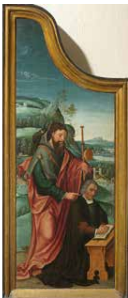
Fig. 6-left Left-hand wing (Jacob Van den Putte with Saint James the Greater) (detail of fig. 4), © KIK-IRPA, Brussels, www.kikirpa.be , cliché X002659, photos: Jean-Luc Elias