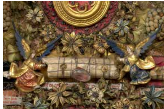
Fig. 2 Bone relic of the 11,000 virgin martyrs labeled, “This comes from the bones of the 11,000 martyred [virgins] (Dit es tgebennte vande[n] xim merteleere[n])” (detail of fig. 1), © KIK-IRPA, Brussels, www.kikirpa.be, cliché X002679, photo: Jean-Luc Elias

the fictive terrain and clarifying the devotional intent of the works. Further observation reveals that the hofjes share a particular thematic emphasis. Running along the lower foreground in most examples are fences made of wood, paper, or fabric, which are usually punctuated by gates (fig. 3). This feature points to a specific passage from the Song of Songs that was interpreted by medieval theologians as a reference to the Virgin Mary’s purity: “a garden enclosed, sister my bride/a garden enclosed, a fountain sealed” (4:12). 2 The descriptive title Besloten hofjes (enclosed gardens) was assigned to the works by art historians who picked up on this connection. 3 However, even as a hofje ’s fence marks the garden as impenetrable, the rich array of dense minutiae all but obligates visual entry. It also invites a measured ocular pace: the eye may quicken momentarily across the varied forms, yet the cabinet’s remarkable content soon compels it to linger. This meticulous way of looking ostensibly sharpened the beholder’s spiritual focus and prolonged the meditative activity. 4 The result: a more intimate and efficacious devotional experience.