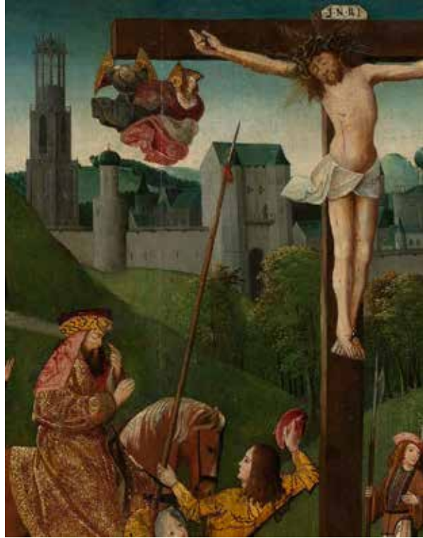
Fig. 14 Circle of Master of the Figdor Deposition, (Utrecht), Crucifixion (detail), 1505, oil on panel, 104.1 cm _ 84.9 cm. Amsterdam, Rijksmuseum, inv. SK-A-2212 (artwork in the public domain)