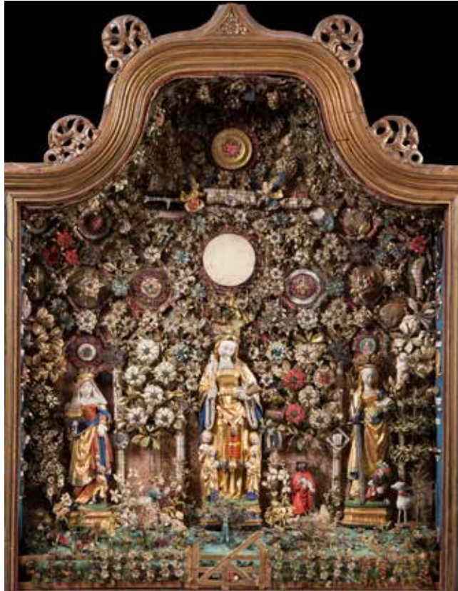
Fig. 1 Mechelen, Besloten Hofje with Saint Elizabeth of Hungary, Saint Ursula, and Saint Catherine of Alexandria, 1513–24 (?) (center cabinet), polychromed wood, silk, paper, bone, wax, wire, and other materials in a wood case, 134 x 97.5 x 22.2 cm. Musea & Erfgoed Mechelen, inv. GHZ BH/2, Collectie Gasthuizusters, Onze-Lieve-Vrouw Waver, © KIK-IRPA, Brussels, www.kikirpa.be on long-term loan from the Augustinian Sisters of Mechelen (artwork in the public domain)