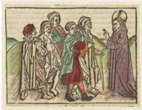
Fig. 11 Attributed to the Master of Antwerp, Christ Heals Two Blind Men and a Mad Man , from Ludolph of Saxony, Tboeck vanden leven ons heeren Jesu Christi (The book of the life of our Lord Jesus Christ) (Zwolle (?), 1485–91). Hand-colored woodcut, 9.2 x 12.4 cm. Amsterdam, Rijksmuseum, inv. RP-P-1961-717

and also in single-sheet prints and printed books that circulated widely. For now, I highlight three such works to be discussed in greater detail below, along with additional examples. The first is a woodcut from a printed version of Ludolph of Saxony's Speculum vitae Christi , translated by the late fifteenth century into Dutch as Tboeck vanden leven ons heeren Jesu Christi (The book of the life of our Lord Jesus Christ), that shows Christ healing a mad man and two blind men; the latter figures' eyes are shut to convey visual impairment ( fig. 11 ). 32 Second, the Master of Alkmaar's Polyptych with the Seven Works of Charity of 1504 ( fig. 12 ) portrays a shut-eyed blind man seeking alms, whose forward movement is guided by a child strapped to his head ( fig. 13 ). Third, some images of the Crucifixion include the Roman soldier, later called Longinus, who disavowed Christ by piercing his side (John 19:34–35) and whose sightless status prevented him from seeing the divine truth; Christ's blood restored his sight. In a Crucifixion painted in Utrecht around 1505 ( fig. 14 ), Longinus points to the closed eyes that signaled his blindness, to ask for assistance in raising his lance to pierce Christ's side. 33