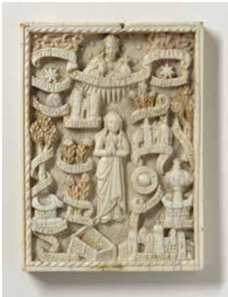
Fig. 20 North Netherlands or Flanders, Immaculate Virgin , ca. 1480–1500, ivory with traces of polychrome, h. 11.3 cm. Amsterdam, Rijksmuseum, inv. BK-2008-69, purchased with the support of the Frits en Phine Verhaaff Fonds/Rijksmuseum Fonds (artwork in the public domain)

the Augustinian hospital at Geel, reformed by the Mechelen sisters in 1552. 56 The Spiritual Bedroom instructs its reader to build in her heart a bridal chamber in which she would receive Christ, her beloved. The sister is to paint the walls green and adorn the edges with painted blossoms to construct an enclosed garden. The green of the walls is described as virginal, thereby connecting the garden directly to sexual propriety via color. 57 Once the room was furnished, Christ would lay with the supplicant and their flesh would metaphorically conjoin in a virtuous expression of conjugal fulfillment. The green foliage in the hoffe , albeit faded with time, may have carried similar symbolic associations for its patrons and audiences thus claiming for Maria its positive values.