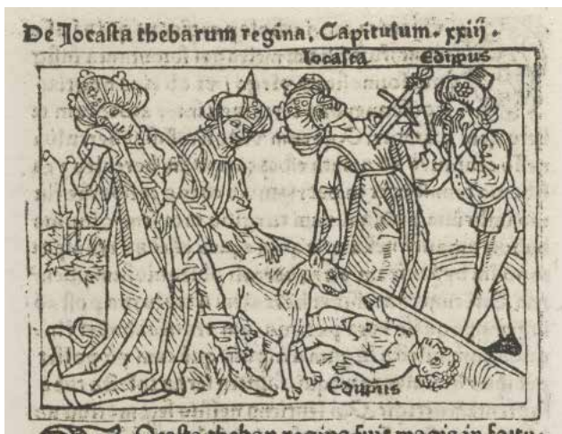
Fig. 19 German, Jocasta and Oedipus , from Giovanni Boccaccio, De mulieribus claris , (Ulm: Johann Zainer, 1473), woodcut, chap. 23. Washington, D.C., Library of Congress, Rosenwald Collection, Incun. 1473.B7, fol. 25v (artwork in the public domain)

23 In contrast to these negative perspectives, the enclosed garden of the hofje carried associations of sexual restraint. The passage in the Song of Songs that eventually came to signal the Virgin Mary's purity—"a garden enclosed, sister my bride / a garden enclosed, a fountain sealed"—ultimately inspired numerous depictions of Mary in walled gardens, such that by the fifteenth century the theme was pervasive in northern European representation. Examples are found in painting, drawing, sculpture, manuscripts, prints, and the fiber arts. In an ivory carving made in the Netherlands at the close of the fifteenth century, Mary is shown in an enclosed garden surrounded by symbols of her purity ( fig. 20 ). 54 Women who professed in religious communities, as Maria had, took a vow of virginity (or chastity if they had already been married). This commitment is addressed in the reform statutes from the Onze-Lieve-Vrouwegasthuis, in part by imposing a modified enclosure for the hospital sisters, which kept contact to a minimum while allowing access to the infirm to administer care. 55 The connection between enclosed spaces and virginity is made explicit in a fifteenth-century devotional text that Kathryn Rudy calls the Spiritual Bedroom , which in all likelihood belonged to sisters at