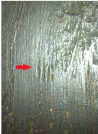
Fig. 26-left “Drie palen” stamps from central cabinets of Besloten Hofjes . Left: Mechelen Musea & Erfgoed, BH/3, stamp located on the right-hand exterior of the cabinet.