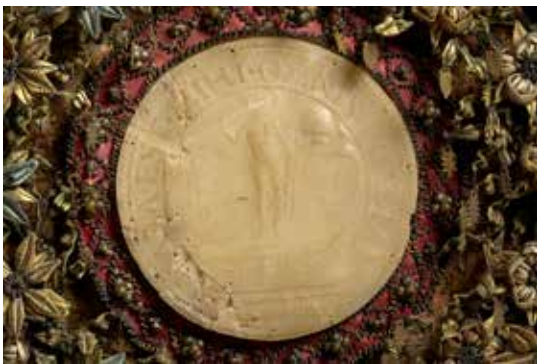
Fig. 10 Wax medallion with the Resurrection , dated 1513 (detail of fig. 1), © KIK-IRPA, Brussels, www.kikirpa.be, cliché X002683, photo: Jean-Luc Elias

molished in the 1860s when the sisters moved to a modern facility, yet it can be at least partially understood through a plan made in 1857 after an earlier one, from 1784 ( fig. 9 ). The plan illustrates a nun's choir ("choor der nonnen") adjacent to a choir proper, which opened up onto the church. The latter space was accessible to the public and visible from the infirmary. However, I would suggest that the depiction of the blind sister in the hoffe was perhaps too intimate for the publicly accessible areas of the hospital. It seems more plausible that it was installed in the nuns' choir or in spaces reserved expressly for the sisters, where images might be kept, such as in their refectory: the statutes of reform state that a sculpture was located there. 29 Whatever the case, the work was likely regularly if not consistently visible to the sisters. Jacob and Margaretha must have depended upon that access to enable a communicative role for the imagery: as argued here, the hoffe makes spiritual claims for them and for Maria, while also reminding Maria's sisters about their commitment to her care as a disabled person.