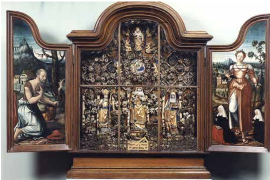
Fig. 29 Besloten Hofje with Saint Anne, the Virgin Mary, and the Christ Child ( Sint-Anna-ten-drieën ), Saint Augustine, and Saint Elisabeth, overview of center cabinet and wings, 150 x 120 x 38 cm, © KIK-IRPA, Brussels, www.kikirpa.be, cliché KN008402, photo: Jean-Luc Elias (see fig. 25)

39 Among my conclusions in that article is that the hofje emphasized the durability of the reforms during a potentially disruptive transitional period in its leadership, after the death of Peeter and the appointment of Marten. The hofje mediated with its internal audiences to keep the reform's leadership, values, and practices alive in the collective memory of the institution. This emphasis on internal conventual life is also apparent in the Saint Anne hofje , which includes portraits of two women who wear habits, both in the right-hand wing (fig. 29). I had surmised preliminarily,