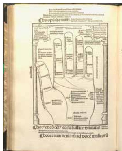
Fig. 18 Jan Mombaer, Chiropsalterium (Handpsalter), from Rosetum exercitiorum spiritualium et sacrarum meditationum (Rosary of spiritual exercises and sacred meditations) (Zwolle, 1510), woodcut, 19.7 x 14.5 cm. Washington, D.C., Library of Congress, Music Division, ML171.M19 Case, n.p. [AaL2] (artwork in the public domain)