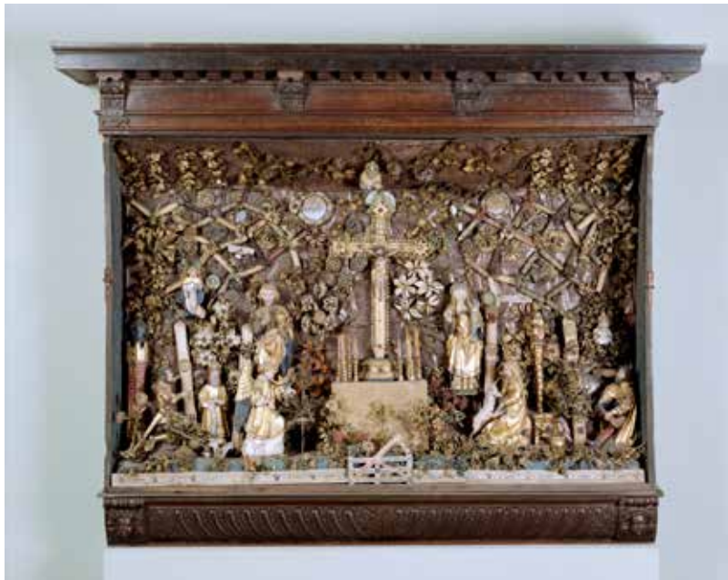
Fig. 23 Mechelen (?), Crucifixion Hofje , ca. 1510–30, polychromed wood, silk, paper, bone, wire, paint, and other materials in a wood case, 158.5 x 139 x 33 cm. Musea & Erfgoed Mechelen, inv. BH/1, Collectie Gasthuizusters, Onze-Lieve-Vrouw Waver, on long-term loan from the Augustinian Sisters of Mechelen, © KIK-IRPA, Brussels, www.kikirpa.be, cliché KN008407, photo: Jean-Luc Elias (artwork in the public domain). Mechelen, Crucifixion Hofje (central cabinet), ca. 1525–28, polychromed wood, silk, paper, bone, wire, paint, and other materials in a wood case, 109 x 89.7 x 19.5 cm. Musea & Erfgoed Mechelen, inv. BH/3, on long-term loan from the Augustinian Sisters of Mechelen (artwork in the public domain)

but rather bought, in 1519, a “crown” (“croone[n]”) made of wax and flowers that hung in their refectory. 86 The express purchase of the “crown” strongly suggests that the sisters procured hand-worked items externally. This is not to say, however, that they avoided manipulating the hofjes in their possession. In the case of the Van den Putte/Svos example, they may have added some of the relics that appear along the inner lateral sides of the cabinets. They also may have been the ones to remove wings that once adorned one of three Crucifixion-themed hofjes at the hospital ( fig. 23 ) 87 : perhaps the work did not originate with the patronage of the community or its associates, and therefore the pictorial content of the shutters, which may have included portraits, did not suit them.