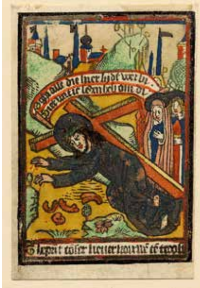
Fig. 30 Sisters at Onze-Lieve-Vrouwe-ten-Troost, Vilvoorde, Christ Falling under the Cross , 1500–20, hand-colored woodcut print, 10.7 x 7.5 cm. London, The British Museum, © The Trustees of the British Museum, inv. 1895,0122.5 (artwork in the public domain)

of gender in the patronage, production, and reception of Besloten hofjes . The Van den Putte/Svos hofje and the reform-related Crucifixion hofje depict not only women but also men. While much is understood about the relationship between women and enclosed garden imagery, the hofjes ask us to consider the male perspective as well. Indeed, it was not only some women but also some men for whom the enclosed garden's references to purity were meaningful: hagiographic sources identify sexual abstinence as a practice of some saintly men, after whom some early modern Netherlandish men modeled their own behavior. 96 Such questions suggest the distance to which modern scholars must reach to appreciate the complex social dimensions of the Besloten hofjes .