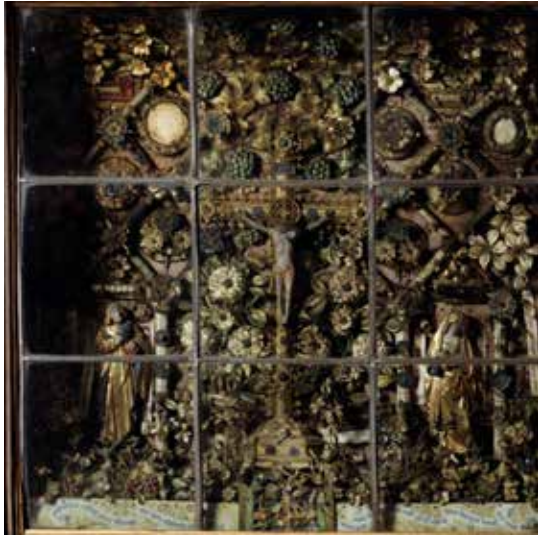
Fig. 24 Mechelen, Crucifixion Hofje (central cabinet), ca. 1525–28, polychromed wood, silk, paper, bone, wire, paint, and other materials in a wood case, 109 x 89.7 x 19.5 cm. Musea & Erfgoed Mechelen, inv. BH/3, Collectie Gasthuiszusters, Onze-Lieve-Vrouw Waver, on long-term loan from the Augustinian Sisters of Mechelen, © KIK-IRPA, Brussels, www.kikirpa.be , cliché KN008410, photo: Jean-Luc Elias (artwork in the public domain) Mechelen (?), Crucifixion Hofje , ca. 1510–30, polychromed wood, silk, paper, bone, wire, paint, and other materials in a wood case, 158.5 x 139 x 33 cm. Musea & Erfgoed Mechelen, inv. BH/1, on long-term loan from the Augustinian Sisters of Mechelen (artwork in the public domain)