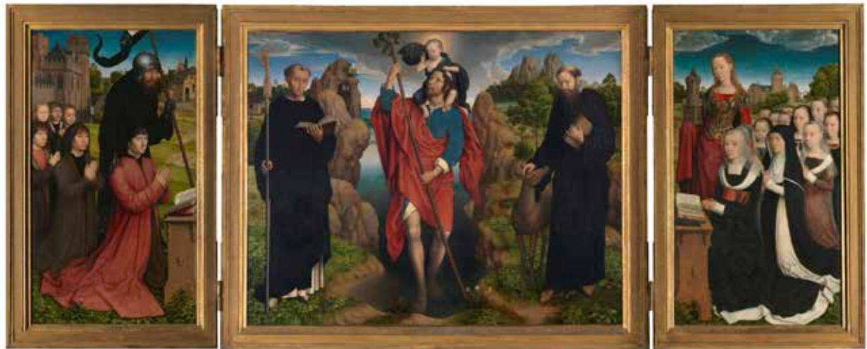
Fig. 7 Hans Memling, Triptych of Willem Moreel and Barbara Van Valenderberch , 1484, oil on panel, (center) 141 x 174 cm, (wings) 141 x 87 cm . Bruges, Groeninge Museum, 0000.GR00091.I-0095.I, © Lukas – Art in Flanders VZW, photo Hugo Maertens, https://creativecommons.org/licenses/by-nc-nd/4.0/legalcode (artwork in the public domain)