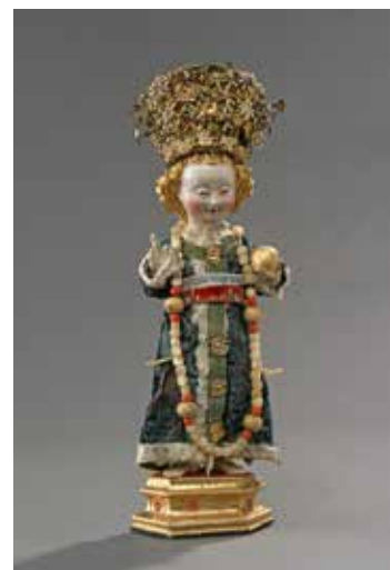
Fig. 16 Mechelen, Christ Child , ca. 1500, polychromed wood, gold, alabaster, velvet, ermine, pearls, and other materials, h. 30.5 cm. Schwerin, Staatliches Museum, Schloss Güstrow. (artwork in the public domain)

21 Other aspects of the hoffs help to illuminate more deeply the relationship between Maria’s problematic body and the hope for her salvation. One is her hands (see fig. 5), which are held together in prayer in conventional fashion. The dorsum of her left hand is the most prevalent feature. The smallest finger and right edge of the left-hand palm peek out from beneath it at the