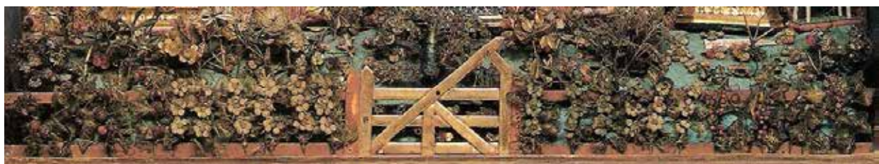
Fig. 3 Detail fig. of 1.

the fictive terrain and clarifying the devotional intent of the works. Further observation reveals that the hofjes share a particular thematic emphasis. Running along the lower foreground in most examples are fences made of wood, paper, or fabric, which are usually punctuated by gates (fig. 3). This feature points to a specific passage from the Song of Songs that was interpreted by medieval theologians as a reference to the Virgin Mary’s purity: “a garden enclosed, sister my bride/a garden enclosed, a fountain sealed” (4:12). 2 The descriptive title Besloten hofjes (enclosed gardens) was assigned to the works by art historians who picked up on this connection. 3 However, even as a hofje ’s fence marks the garden as impenetrable, the rich array of dense minutiae all but obligates visual entry. It also invites a measured ocular pace: the eye may quicken momentarily across the varied forms, yet the cabinet’s remarkable content soon compels it to linger. This meticulous way of looking ostensibly sharpened the beholder’s spiritual focus and prolonged the meditative activity. 4 The result: a more intimate and efficacious devotional experience.