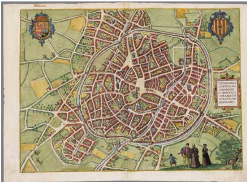
Fig. 8 G. Braun and F. Hogenberg, Plan of the City of Mechelen , from Civitates Orbis Terrarum, Liber primus (Cologne, 1574) Mechelen, Stadsarchief, beeldbankmechelen.be, B.6522