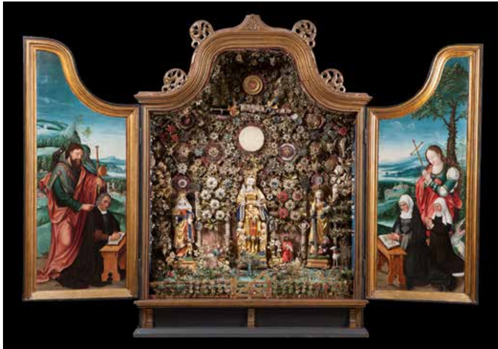
Fig. 4 Overview of center cabinet (see fig. 1) and wings, oil on panel, 134 x 188.5 x 22.2 cm.

example produced in the early modern Low Countries seems at odds with this premise. A woman kneeling in prayer in one of two portrait wings attached to the work (fig. 4) is depicted with her eyes closed and with malformed ocular orbits (fig. 5), most likely to indicate that she is blind, or at the very least visually impaired. 5 This condition would have necessarily precluded her from entering the hoffe 's garden visually, from engaging ocularly with the garden's botanical elements and relics.