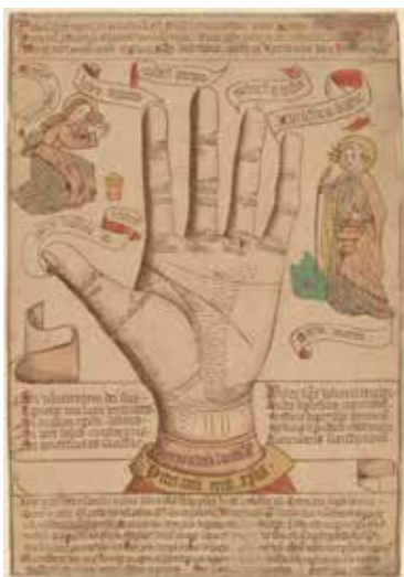
Fig. 17 Netherlandish (?), The Hand as the Mirror of Salvation , 1466, hand-colored woodcut, 39.138.9 x 2726.8 cm. Washington, D.C., National Gallery of Art, Rosenwald Collection, inv. 1943.3.639 (artwork in the public domain)