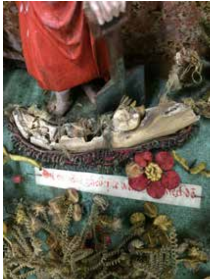
Fig. 21 Jawbone relic labeled, "This is from the bones of the 11,000 virgins (Dit es ghebe[e]nte vande[n] xim mechde[n])," (detail of fig. 1)

enclosed garden, thereby linking the themes of the text to those of the Besloten hofjes . Inhaling sweet scents in walled gardens was in fact considered a more effective way to promote health and healing than doing so in open gardens, for the barriers retained and intensified the fragrances of the plantings therein. 62