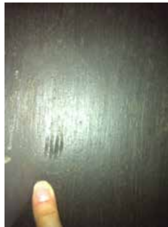
Fig. 26-right “Drie palen” stamps from central cabinets of Besloten Hofjes . Right: Mechelen Musea & Erfgoed, BH/6, stamp located on the left-hand exterior of the cabinet.