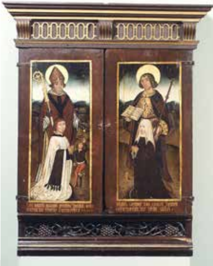
Fig. 28 Crucifixion Hofje , exterior wings, oil on panel, 109 x 89.7 cm (see fig. 2423)

39 Among my conclusions in that article is that the hofje emphasized the durability of the reforms during a potentially disruptive transitional period in its leadership, after the death of Peeter and the appointment of Marten. The hofje mediated with its internal audiences to keep the reform's leadership, values, and practices alive in the collective memory of the institution. This emphasis on internal conventual life is also apparent in the Saint Anne hofje , which includes portraits of two women who wear habits, both in the right-hand wing (fig. 29). I had surmised preliminarily,