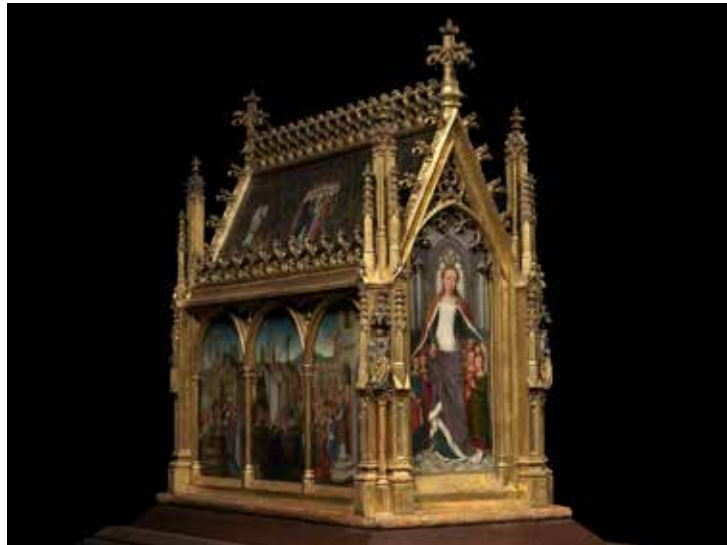
Fig. 22 Hans Memling, Saint Ursula Shrine , 1489, oil and gilt on wood, 9991.5 x 91.599.2 x 41.5 cm. Bruges, St. John's Hospital, © Lukas – Art in Flanders VZW, photo Hugo Maertens, https://creativecommons.org/licenses/by-nc-nd/4.0/legalcode (artwork in the public domain)