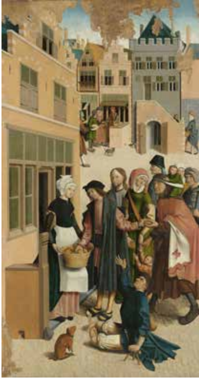
Fig. 13 Distributing Bread to the Blind and Needy (detail of fig. 12), oil on panel, 103.5 cm _ 55 cm. Amsterdam, Rijksmuseum, inv. SK-A-2815-1 (artwork in the public domain)