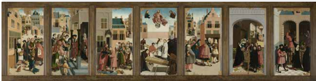
Fig. 12 Master of Alkmaar, Polyptych with the Seven Works of Charity , 1504, oil on panel, 119.1 x 469.5 cm (with frame). Amsterdam: Rijksmuseum, inv. SK-A-2815, purchased with the support of the Vereniging Rembrandt and the Commissie voor Fotoverkoop (artwork in the public domain)