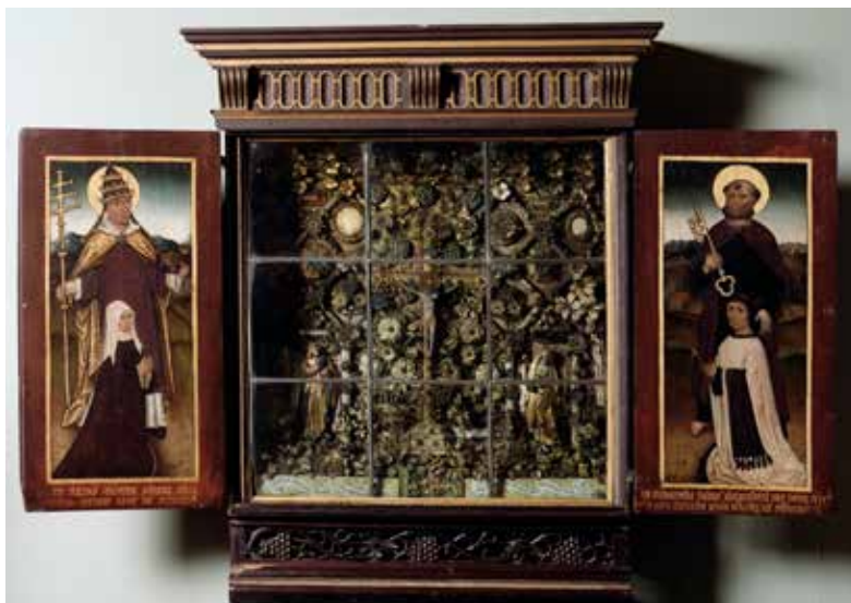
Fig. 27 Crucifixion Hofje , overview of center cabinet and wings, oil on panel, 109 x 151.5 x 19.5 cm (see fig. 2423), © KIK-IRPA, Brussels, www.kikirpa.be , cliché KN008410, photo: Jean-Luc Elias