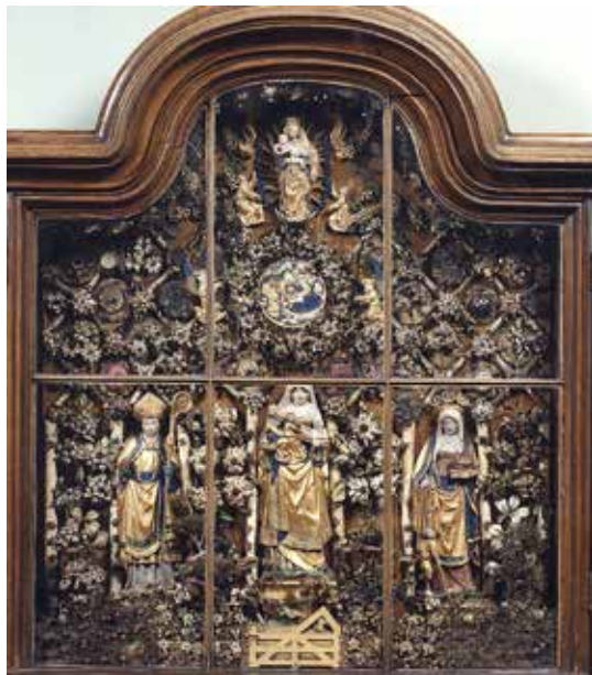
Fig. 25 Mechelen, Besloten Hofje with Saint Anne, the Virgin Mary, and the Christ Child (Sint-Anna-ten-drieën), Saint Augustine, and Saint Elisabeth (center cabinet), 1529 (?), polychromed wood, silk, paper, bone, wax, wire, and other materials in a wood case, 150 x 120 x 38 cm. Musea & Erfgoed Mechelen, inv. BH/6, Collectie Gasthuiszusters, Onze-Lieve-Vrouw Waver, on long-term loan from the Augustinian Sisters of Mechelen, (artwork in the public domain)