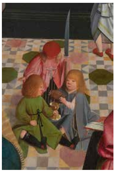
Fig. 5 Geertgen tot Sint Jans (or workshop), James the Greater, John the Evangelist, and Simon, detail of fig. 1.