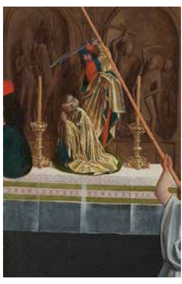
Fig. 4 Geertgen tot Sint Jans (or workshop), Altar with Sacrifice of Isaac, detail of fig. 1.