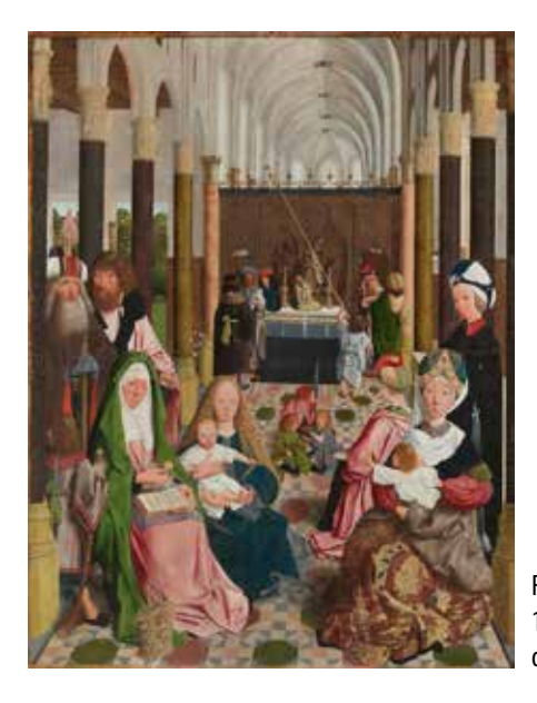
Fig. 1 Geertgen tot Sint Jans (or workshop), Holy Kinship , 1496, oil on oak, 137.2 x 105.8 cm. Rijksmuseum, Amsterdam, inv. no. SK-A-500 (artwork in the public domain)

Three children play at the center of the Amsterdam Holy Kinship , which is attributed to Geertgen tot Sint Jans or his workshop. This seemingly quotidian subject is remarkable because it shows future martyrs engaged in a game of make-believe using the implements of their torments. In this paper, I argue that the activity occupying the boys offers an invitation to spiritual play that addressed viewers and asked them to find joy in the promise of God's divine mercy and justice despite life's hardships. Given the subject matter and the identity of the artist's primary employer, it is probable that the audience included the Knights of St. John Hospitaller, an order of crusading monks, also known as the Johanniters, in Haarlem. The invitation offered in the panel not only addressed the daily work of being a monk but also offered encouragement to the Haarlem knights during a controversial period. Dol: 10.5092/jhna.2015.8.1.1