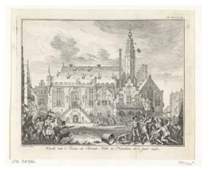
Fig. 3 Simon Fokke, Het Kaas-en Broodvolk te Haarlem , 1492, 1750, engraving on paper, 164 x 203 mm. Rijksmuseum, Amsterdam, inv. no. RP-P-0B-78.392 (artwork in the public domain)

in early 1492, the city initially held off the rebels. With the aid of fifth columnists, however, the mob made its way into the city through the Kruispoort. They moved along the Kruisstraat, which ran behind the commandery, to the nearby Groote Markt. Once they reached Haarlem's center, they stormed city hall (fig. 3) and killed three people, including Claes van Ruyven, who was tax collector for Kennemerland. According to legend, one of the rebels (Walich Dirkszoon) cut up van Ruyven's body and sent it to the dead man's wife in a trunk along with a morbid poem.<sup>22</sup> The mob then turned its attention to the homes of wealthy citizens and to local institutions.