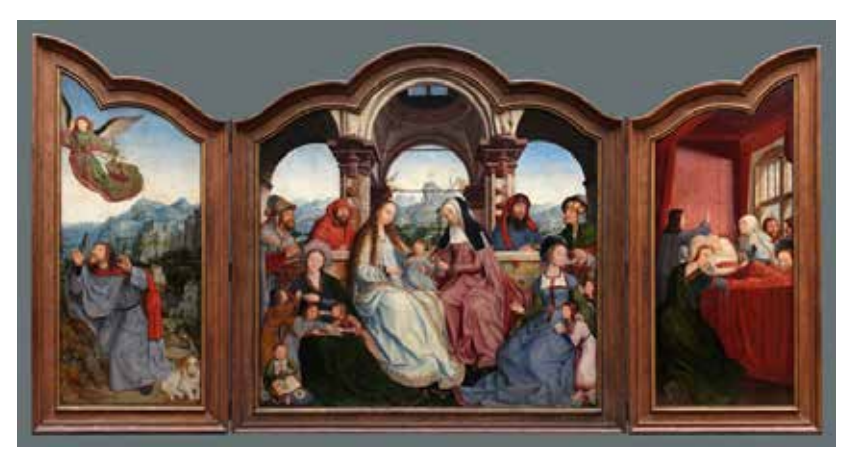
Fig. 2 Quentin Massys, Saint Anne Altarpiece , 1507—8, oil on panel, (center) 219 x 224.5 cm, (each wing) 220 x 92 cm. Museum of Fine Arts, Brussels (artwork in the public domain)

Other scholars have provided compelling interpretations of the Amsterdam Holy Kinship as a meditation on the sacrifice of Christ, a complex explanation of the Eucharist, an object involved in the ongoing debate over the Immaculate Conception, and a variation on the theme of the Ecce Agnus Dei .<sup>7</sup> The analysis that I offer here works in combination with these already established readings. My aim in this paper is to nuance our understanding of the work by delving into a motif running parallel to the main subject of the image (i.e., the boys engaged in a game of make-believe). In what follows, I argue that the activity which occupies the boys at the center of the painting is an invitation to engage in a pleasurable spiritual exercise which was addressed the panel's patrons and encouraged them to maintain confidence in the hope of eternal salvation despite life's hardships. This invitation to holy play--a form of recreation that helped to inculcate virtue--was particularly important for the Knights of St. John in the period around the panel's creation.