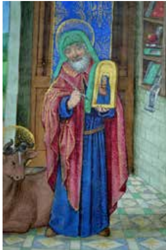
Fig. 5 Detail of Saint Luke. Master of the Dresden Prayerbook, Saint Luke, in Donne Hours , fol. 116v (full page not pictured)(artwork in the public domain)