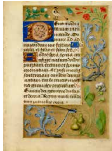
Fig. 15 Detail of the lower margin. Simon Marmion, John Donne Kneeling Before His Guardian Angel, in Donne Hours (see fig. 1), fol. 100v (full page not pictured) (artwork in the public domain)

16 The calendar of the Louvain-la-Neuve manuscript was illustrated by the Master of the Dresden