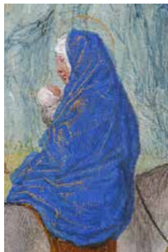
Fig. 3 Detail of the Virgin. Simon Marmion, Flight into Egypt, in Donne Hours, fol. 72 (full page not pictured)(artwork in the public domain)