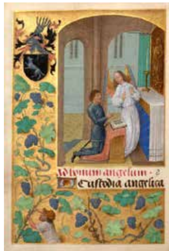
Fig. 1 Simon Marmion, John Donne Kneeling Before His Guardian Angel, in Donne Hours, ca. 1480, tempera on parchment. Louvain-la-Neuve, Archives de l'Université, Ms A2, fol. 100v (artwork in the public domain)