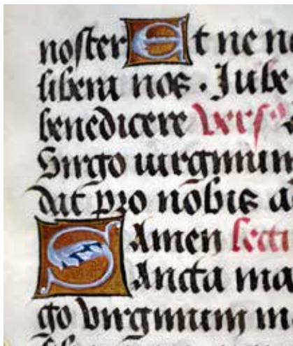
Fig. 17. Initials. Donne Hours (fig. 1), fol. 21 (artwork in the public domain)