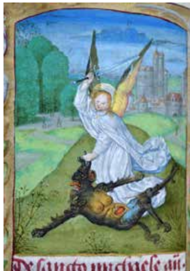
Fig. 13 Detail of Saint Michael. Master of the Dresden Prayerbook, Saint Michael, in Donne Hours , fol. 108v (full page not pictured) (artwork in the public domain)

have been fundamentally reworked. The work by the two hands is clearly separate, and it is likely that the miniatures by the Master of the Dresden Prayerbook were added later. These miniatures must have been produced in a short space of time, which could explain the presence of trees that do not reflect the style of the two masters involved. Indeed, the Master of the Dresden Prayerbook could have asked one or more illuminators, from his own workshop or not, to paint part of the landscapes while he himself did the figures, making it possible to work on two leaves simultaneously and so shorten the time taken to prepare the miniatures.