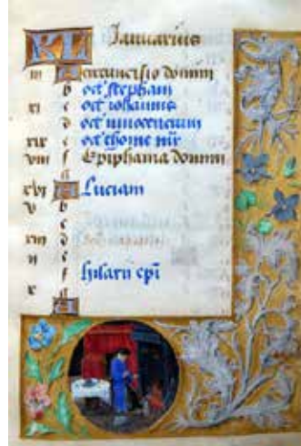
Fig. 10 Master of the Dresden Prayerbook, January, in Donne Hours, fol. 1 (artwork in the public domain)

the border decoration (fig. 9). On some of these leaves, the line forming the lower part is doubled, as if it were a correction. Thus the layout, the painting of the margins, and the way they are delimited serve to distinguish three distinct parts in the volume: the calendar, the body of the book illustrated by Marmion, and the leaves attributed to the Master of the Dresden Prayerbook in the suffrages.