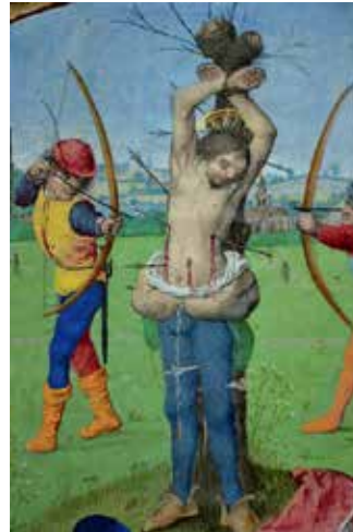
Fig. 6 Detail of Saint Sebastian. Master of the Dresden Prayerbook, Martyrdom of Saint Sebastian, in Donne Hours , fol. 103v (full page not pictured) (artwork in the public domain)