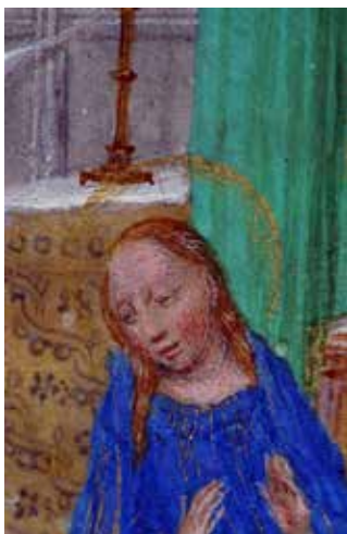
Fig. 2 Detail of the Virgin. Simon Marmion, Annunciation, in Donne Hours, fol. 13 (full page not pictured)(artwork in the public domain)