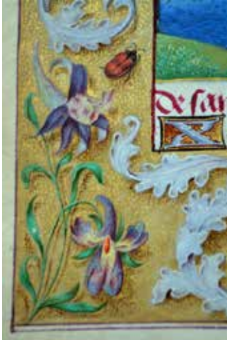
Fig. 9 Detail of the border decoration. Donne Hours, fol. 105v (full page not pictured) (artwork in the public domain)