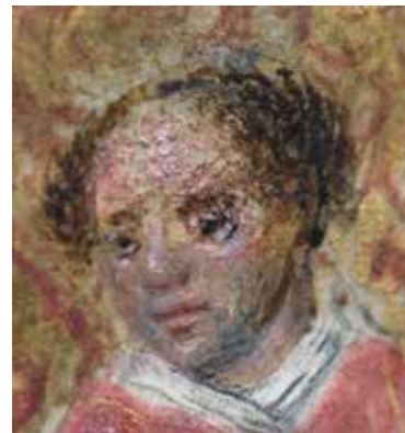
Fig. 12 Detail of Saint Leonard. Simon Marmion, Saint Leonard, in Donne Hours, fol. 112v (full page not pictured)(artwork in the public domain)