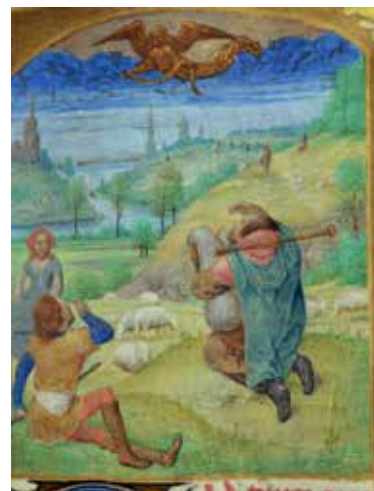
Fig. 4 Detail. Simon Marmion, Annunciation to the Shepherds, in Donne Hours, fol. 58 (full page not pictured)(artwork in the public domain)