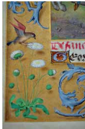
Fig. 8 Detail of the border decoration. Donne Hours (fig. 1), fol. 99v (full page not pictured) (artwork in the public domain)

the fineness of execution of the decorations that accompany Marmion's illustrations (fig. 9). The shading is much less subtle and heightens the contrast between the decorative elements and the gold layer. The gold stippling that delicately models the background in Marmion's work becomes here systematic and unrefined. The margin contours are also different. Marmion defined their area, on both the inside and the outside, by a gold line applied when the marginal decoration was substantially or fully completed (fig. 8). This same technique was applied to the gilded, ochre, or gray margins of the calendar illustrated by the Master of the Dresden Prayerbook (fig. 10). By contrast, in the body of the manuscript, the margins around the miniatures by the Master of the Dresden Prayerbook are delimited by a purple line that was applied ahead of the production of