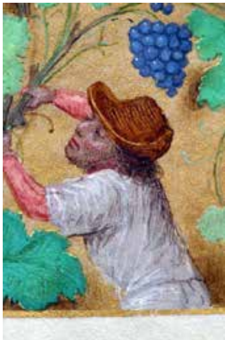
Fig. 15 Detail of the lower margin. Simon Marmion, John Donne Kneeling Before His Guardian Angel, in Donne Hours (see fig. 1), fol. 100v (full page not pictured)(artwork in the public domain)