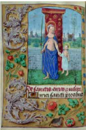
Fig. 7 Master of the Dresden Prayerbook, Saint Quiricus and His Mother Saint Julietta, in Donne Hours , fol. 107v (full page not pictured)(artwork in the public domain)