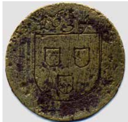
Fig. 1b Guild Funeral Medallion of Rembrandt (verso), 1634, diameter 28 mm. Rembrandt House Museum, Amsterdam.