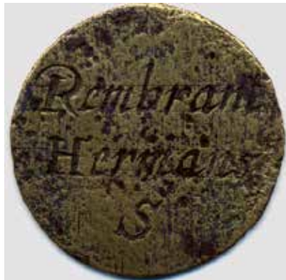
Fig. 1a Guild Funeral Medallion of Rembrandt (recto), 1634, diameter 28 mm. Rembrandt House Museum, Amsterdam.

referring to the profession of painting [ schilderen ].