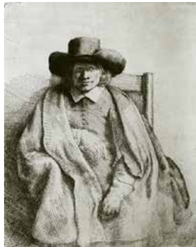
Fig. 7 Rembrandt, Clement de Jonghe , 1651, etching, 207 x 161 mm. (B. 272)

about it. 56 Concerning Jan Janse de Vries, I cannot even say if he is identical with the guild brother of that name from 1688.