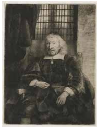
Fig. 3 Rembrandt, Thomas Haringh ("The Old Haringh"), ca. 1655, drypoint and burin, 195 x 150 mm. (B.274)

only vaguely dated, and rather incorrectly as it appears now from the Bankruptcy Chamber's journal. 25 In the relevant journal, one can find, in the account of November 1, 1656, the first sale at the lower end of the entries, thus certainly held in September of that year, and with a revenue of |1322:15:-- . On March 21, 1658, there follows the account regarding the, now luckily-dated, goods that were sold [ vercofte goederen ] on November 21, 1657, for |2516:10:-- . On July 26, 1658, two sales were accounted for: one of goods sold on April 18 for |432: 5:-- (according to the authorization of February 14 these were furniture and house contents) and one of a few paintings sold on July 5 for |95:15:-- . Certainly the last was a small auction, which coincided with two other sales of paintings. Then finally on February 14, 1659, three sales were accounted for: paintings on October 29, 1658, for |126:10:-- and sold goods on December 20, 1658, in one case for |80:--:-- and another for |390: 9:-- . The sale of October 29 took place as a follow up to two other sales of paintings and one of prints on October 28.