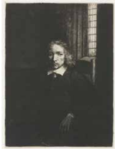
Fig. 6 Rembrandt, Pieter Haringh ("The Young Haringh"), 1655, drypoint and burin, 195 x 146 mm. (B. 275)

57 On Saturday, December 25, 1655, the first sale took place and six more were to follow, presumably from December 27 until January 1, 1656. Who was the auctioneer at this important sale? We can choose between the just-appointed De Blocq, the surgeon Hartmans, and Haringh. Understand that my thoughts go to the latter.