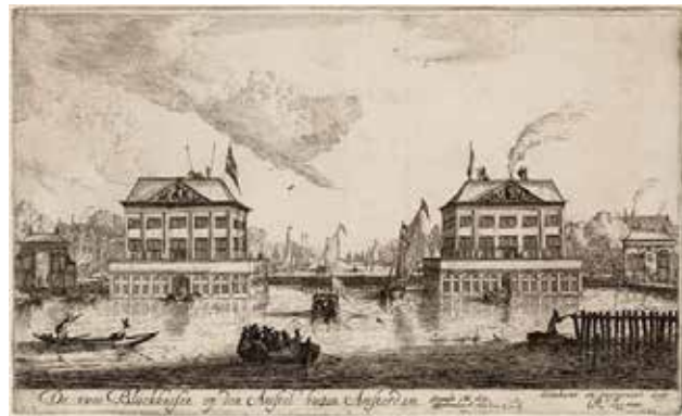
Fig. 6 Reinier Nooms (1623/24–1664), etcher, Blockhouses on the Amstel , ca. 1654, print. Stadsarchief, Amsterdam, inv. no. 010001000126 (artwork in the public domain)