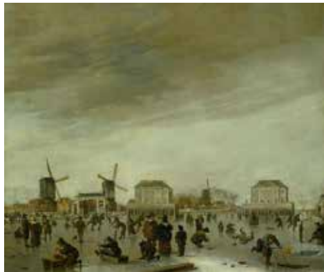
Fig. 2 Hendrick Dubbels (1621–1707), The Blockhouses on the Amstel in Winter , ca. 1651–54, oil on canvas, 47.5 x 56 cm. Amsterdams Historisch Museum, Amsterdam, inv. no. SB 45211 (artwork in the public domain)

river in Amsterdam (fig. 2), in spite of standing for only three years (1651–54), also appear in a large number of images.