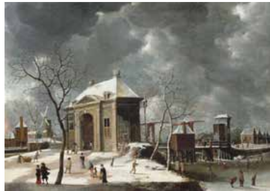
Fig. 15 Abraham Beerstraten (b. 1644), The Heiligewegspoort Viewed from the North-west , ca. 1664, oil on panel, 88.9 x 126.4 cm. Formerly Christie's, Private collection, London