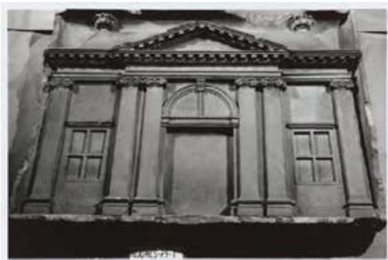
Fig. 19 Gable stone with the Heiligewegspoort, ca. 1664, sandstone, 70 x 98 cm. Koninklijk Oudheidkundig Genootschap, Amsterdam (artwork in the public domain)