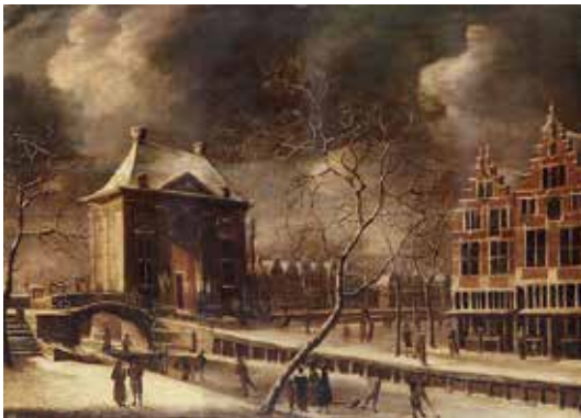
Fig. 14 Abraham Beerstraten (b. 1644), The Heiligewegspoort Viewed from the North-east , ca. 1664, oil on panel, 75.2 x 106.3 cm.

inside the city. 46 Abraham Beerstraten's two paintings view the gate from the northeast and northwest (figs. 14 and 15, respectively). Each places the gate slightly off-center, with the view from the northwest including the double-span drawbridge and the fore gate over the canal and the view from the northeast including in the background the houses built by Philips Vingboons for Jacob Cromhout, completed in 1662. 47 The painting by Lundens also presents the gate from the northeast, in this case the location of a festive and crowded fair. Each of the paintings pays close attention to the architectural detail of the gate, but even here differences are readily spotted. The attic storey in Lundens's painting is much taller than in either of Beerstraten's, especially the view from the northwest. The sculptural relief in the central pediment, clearly a ship in Beerstraten's view from the northwest, is difficult to read but appears to be different in the other two paintings. 48