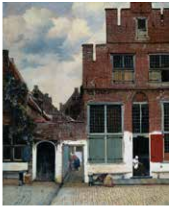
Fig. 3 Johannes Vermeer (1632–1675), The Little Street , ca. 1659–61, oil on canvas, 53.5 x 43.5 cm. Collection Rijksmuseum, Amsterdam, inv. no. A2860 (artwork in the public domain)

arguing that Johannes Vermeer only painted the buildings in the Little Street (fig. 3) when he