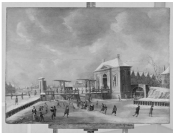
Fig. 1 Jan Abrahamsz. Beerstraten (1622–1666), The Heiligewegspoort , 1665, oil on panel, 75 x 104 cm. National Gallery of Ireland, Dublin, inv. no. NGI 679. Photograph courtesy of the National Gallery of Ireland (artwork in the public domain)