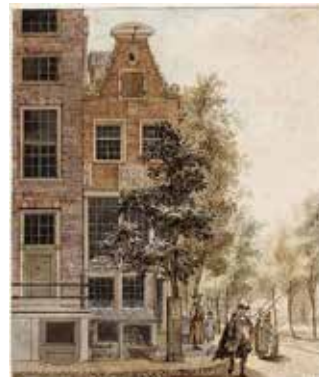
Fig. 20 Reinier Vinkeles (1741–1816), Koningsplein Viewed from the Sluice on the Herengracht, 1764, drawing.