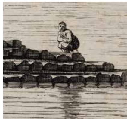
Fig. 4a Detail of Fig. 4