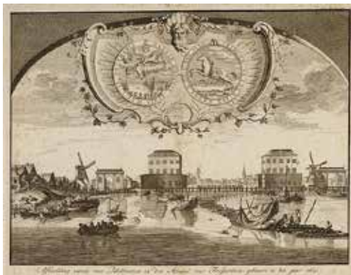
Fig. 11 Bernard Picart (1673–1733), Blockhouses on the Amstel, ca. 1711, print, (artwork in the public domain)