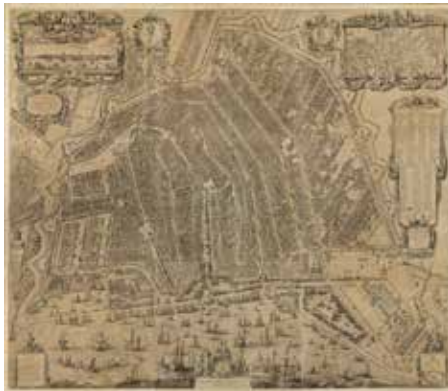
Fig. 12 Balthasar Florisz. van Berckenrode (ca. 1591–ca. 1645) and Jacobus Aertsz Colom (1599–1673), Map of Amsterdam (detail), third edition, 1657 (first printed 1625), etching and engraving in fourteen sheets, 147 x 160 cm. Stadsarchief, Amsterdam, inv. no. 10035/390 (artwork in the public domain)