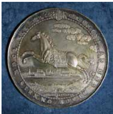
Fig. 10 Sebastian Dadler (1586–1657), medal commemorating the death of Prince Willem II, 1650, silver, 7 x 7 cm. Amsterdams Historisch Museum, Amsterdam, inv. no. PA 449 (artwork in the public domain)