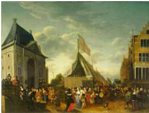
Fig. 13 Gerrit Lundens (1622–1683), Fair at the Heiligewegspoort , ca. 1637–83, oil on canvas, 129 x 171.5 cm. Amsterdams Historisch Museum, Amsterdam, inv. no. SA31313 (artwork in the public domain)

36 Gates and urban defenses appear in many images from the period, conveying ideas about military and economic power and physical growth, along with narratives of urban history. 43 The numerous city descriptions written in the seventeenth century, such as Olfert Dapper's Historische beschrijvinge van Amsterdam of 1663, catalogue gates among the city's important monuments. The popularity of Heiligewegspoort imagery in particular is evidenced by its appearance in ten known paintings, including two works by Abraham Beerstraten and several by Jan van Kessel and his followers, as well as at least a dozen prints and drawings. 44 The gate is shown from a variety of viewpoints both outside and within the city, as in a painting by Gerrit Lundens (fig. 13), and there are slight variations in the building's proportions and its position within the surrounding landscape. These variations suggest that at least some of the images may have been made by artists who had not seen the gate.