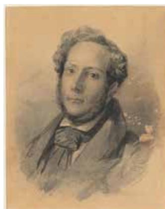
Fig. 24 Johann Wilhelm Kaiser, Self-Portrait , mezzotint, pencil, brush in gray, 216 x 173 mm. Rijksmuseum, Amsterdam, inv. no. RP-T-1999-11 (Artwork in the public domain).