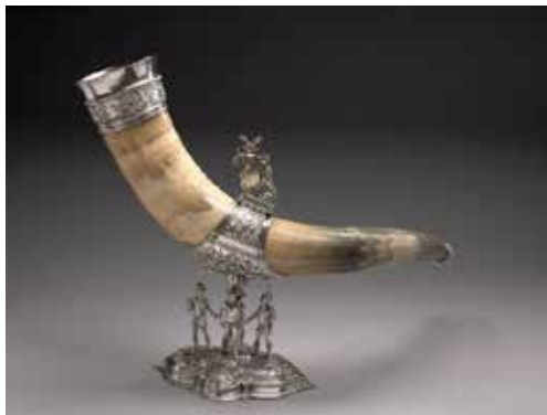
Fig. 32 Unknown artist, Drinking Horn of the Saint Sebastian, or Longbow, Militia Guild , 1566, buffalo horn, partly gilded silver, 46 x 53.5 x 23.8 cm. Amsterdam Museum, Amsterdam, inv. no. KA 13966 (Artwork in the public domain).

of governors started to argue strongly that works of antiquarian value and historical objects, such as those from the Curiosities Room should be included in such an exhibition (fig. 32). 31 Frederik Muller, a well-known Amsterdam bookseller, antiquarian, and collector of historical prints, and a previous chairman of the society, proposed such a selection in the board meeting of May 19, 1877. He argued that the Cabinet of Curiosities in the Town Hall was almost inaccessible and that it was impossible to present all objects in a good way. As the minutes record: “now is the time to convince the city council that Amsterdam should establish its own museum; he indicates that he does not propose this in the interest of the K.O.G. but only in the interest of the city.” 32