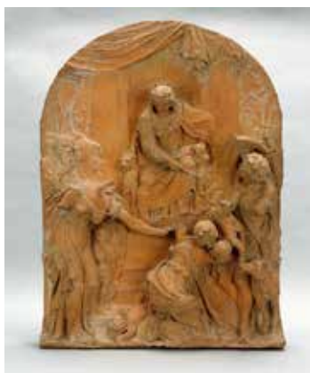
Fig. 23 Artus Quellinus and his studio, The Judgment of Solomon , 1650–64, terracotta, 80.2 x 60.3 x 13 cm. Amsterdam Museum, Amsterdam, inv. no. BA 2517 (Artwork in the public domain).