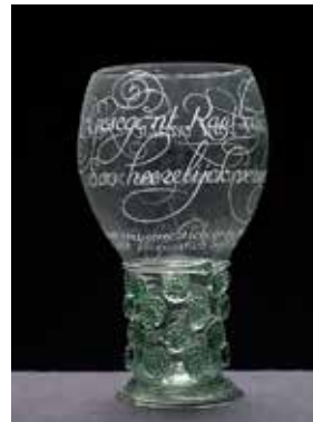
Fig. 6 Unknown artist, Rummer on the Occasion of the Inauguration of the New Town Hall , 1655, glass, h. 23.7 (goblet: diameter 13.5; mouth: diameter 11.5; foot: diameter 9.3 cm). Amsterdam Museum, Amsterdam, inv. no. KA 13952 (Artwork in the public domain).