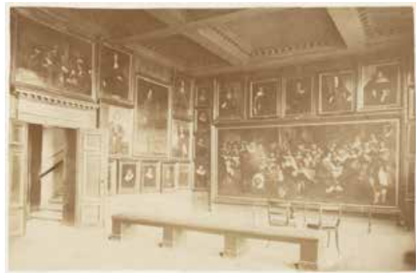
Fig. 10 Unknown photographer, The Rembrandt Room of the Rijksmuseum in the Trippenhuis, ca. 1880, photograph. Amsterdam City Archives, Amsterdam, 010003000526.

walking distance of each other, many tourists made a combined visit. A few people also visited the nearby Town Hall, which was home to important and interesting municipal collections, including over 130 paintings and many applied-art and historical items. 7 Since 1852, the city archivist, who reported to the burgomaster and the aldermen of Amsterdam, had borne responsibility for these collections. 8 The large paintings collection, which included many works of high quality, was scattered in halls, galleries, rooms, and little corners of the building, such as the Council Chamber (fig. 11). Several of them hung on the walls of the Cabinet of Curiosities, the Cabinet of Arms, and the Models rooms. Although these rooms were open during special hours for visitors, access to them was difficult (figs. 12 and 13). 9