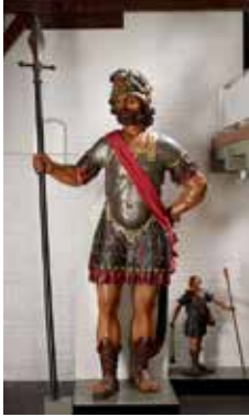
Fig. 2 Attributed to Albert Jansz. Vinckenbrinck, David, Goliath and His Shield-bearer , 1648–50, wood and various materials, h. 486 cm, 264 cm, and 112 cm. Amsterdam Museum, Amsterdam, inv. no. BA 2435 (Artwork in the public domain; photograph provided by Amsterdam Museum).

originally had come from an Amsterdam maze (fig. 2). Owing to the sheer size of the giant (almost five meters tall), the group was displayed just inside the east entrance, where Goliath's head practically touched the vaults. Verlaine found the group "slightly mad, not in the right place, it would have been better in the municipal Amsterdam Museum for civic antiquities" 1