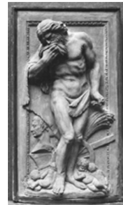
Fig. 18 Artus Quellinus and his studio, Saturn , 1650–64, terracotta, coniferous wood, 90 x 49 cm (including the wooden frame). Amsterdam Museum, Amsterdam, inv. no. BA 2508 (Artwork in the public domain).