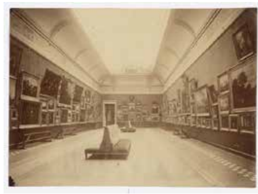
Fig. 8 The Museum Van der Hoop Gallery in the Rijksmuseum, ca. 1885–90, photograph.