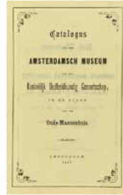
Fig. 30 Catalogue of the Amsterdam Museum of the K.O.G. 1877, Koninklijk Oudheidkundig Genootschap, Amsterdam, inv.no. 44 (Artwork in the public domain;).

English traveler who visited Amsterdam in 1875, also articulated that concern. During his tour of the collections in the Town Hall, Gower expressed his utter surprise that the city allowed beautiful paintings by Ferdinand Bol and Van der Helst to be hidden away in badly lit office spaces where they could barely be admired. “No nation but the Dutch or English would allow these two works to remain in their present situation...Amsterdam is promised a gallery worthy of its pictorial treasures, but at present there are no signs of this much-to-be-wished idea being carried out.” 28