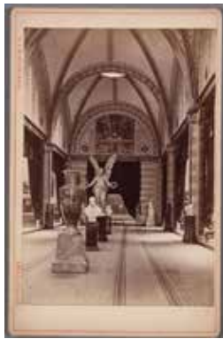
Fig. 7 Douwes Brothers (publisher), Eregalerij (Gallery of Honor) in the Rijksmuseum, ca. 1885, photograph. Amsterdam City Archives, Amsterdam, 010005000819 (Artwork in the public domain;).