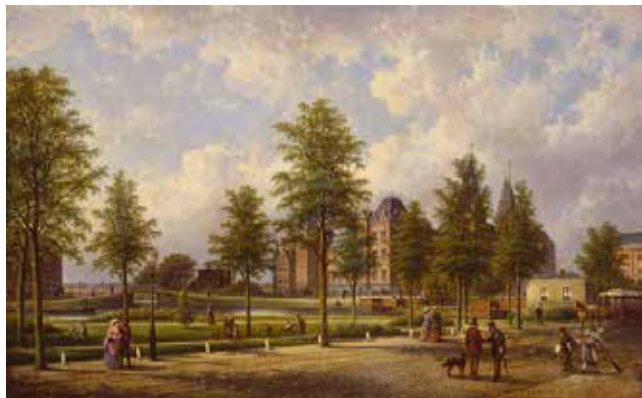
Fig. 1 Johannes Hilverdink, View of the Rijksmuseum from the Weteringschans , 1885, oil on canvas, 66 x 106 cm. Amsterdam Museum, Amsterdam, inv. no. SA 882 (Artwork in the public domain).

Starting in the 1830's, city history museums were founded in the Netherlands. Amsterdam was late: the first Amsterdam Historical Museum opened only in 1926. A short lived predecessor was the Amsterdamsch Museum van het Koninklijk Oudheidkundig Genootschap (Amsterdam Museum of the Royal Dutch Antiquarian Society) (January – June 1877), founded after the closing of a large scale exhibition on the history of Amsterdam in 1876. The exhibition displayed many works of art and history from the rich collections of the city of Amsterdam. Large parts of these had been given on long term loan to the State, to be placed in the new building for the Rijksmuseum that opened in 1885. The article describes the tensions that arose between those who saw the conservation and presentation of the city's art and historical collections as a matter of local pride and those whose goal for these objects was placement in a context that furthered national ambitions, namely the Rijksmuseum. DOI 10:5092/jhna.2011.3.2.4