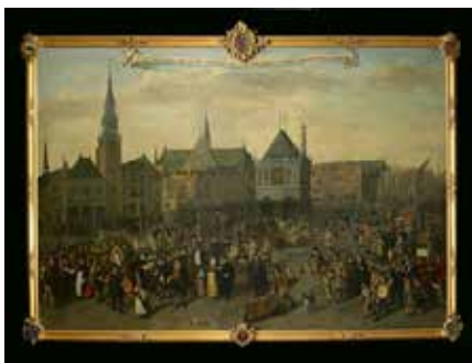
Fig. 16 Adriaen van Nieulandt, Dam Square with the Lepers' Parade of 1604 on Coppers Monday ( Koppertjes Maandag ), 1633, oil on canvas, 212 x 308 cm. Amsterdam Museum, Amsterdam, inv. no. SA 3026 (Artwork in the public domain; photograph provided by Amsterdam Museum).