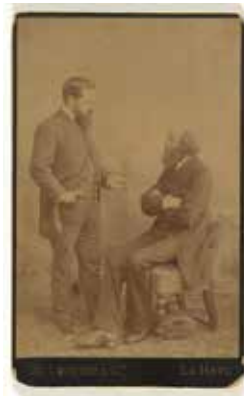
Fig. 33 Unknown photographer, Victor E. L. de Stuers (1843–1916) and Pierre J. H. Cuypers (1827–1921), ca. 1880, photograph. Rijksmuseum, Amsterdam, inv. no. RMA-SSA-F-08009 (Artwork in the public domain; photograph provided by Rijksmuseum).