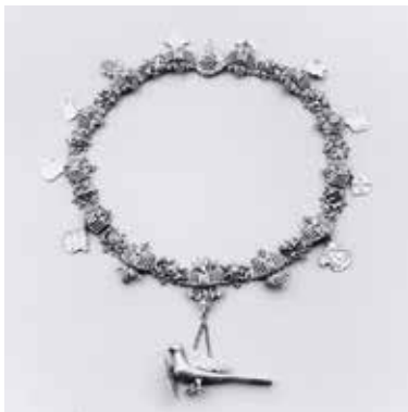
Fig. 5 Unknown artist, Chain of the Saint Joris Guild , 1510–30, silver, diameter 37.5 cm. Amsterdam Museum, Amsterdam, inv. no. KA 13963 (Artwork in the public domain).