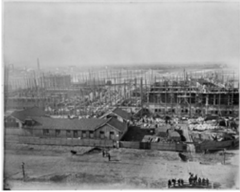
Fig. 29 Unknown photographer, The Rijksmuseum under Construction , ca. 1879, photograph. Rijksmuseum, Amsterdam, inv. no. RMA-SSA-F-02878 (Artwork in the public domain; photograph provided by Rijksmuseum).