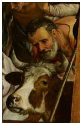
Fig. 17 Pieter Aertsen, The Adoration of the Shepherds ( Aanbidding der Herders ) (fragment), 1549–69, oil on panel, 89.8 x 59.2 cm. Amsterdam Museum, Amsterdam, inv. no. SA 7255 (Artwork in the public domain).