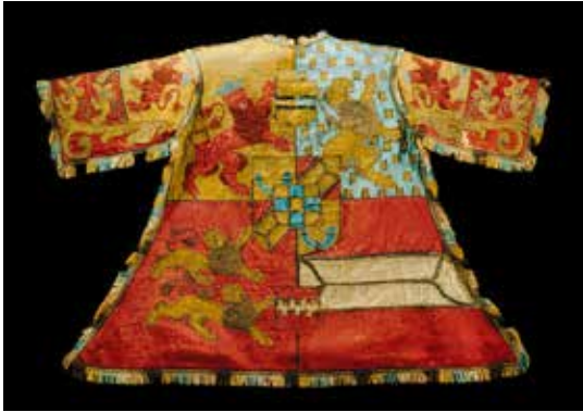
Fig. 21 Unknown artist, The Nassau Tunic , ca. 1640, linen, silk, metal thread, 86 x 125 cm. Rijksmuseum, Amsterdam, on loan from the K.O.G., inv. no. NG-KOG-42 (Artwork in the public domain).

regions all over the Netherlands much more publicly accessible. This K.O.G. museum was housed in the former premises of Gerard Heineken's brewery on the Spuistraat, in the medieval center of the city. Indeed Gerard Heineken played an active and prominent role in the society (fig. 22). 16 During the 1860s, the K.O.G. was also involved in the important initiatives undertaken for a new building for the Rijksmuseum mentioned above, where the society hoped to show its collections. Some members of the society's board even held high positions at the Rijksmuseum. 17