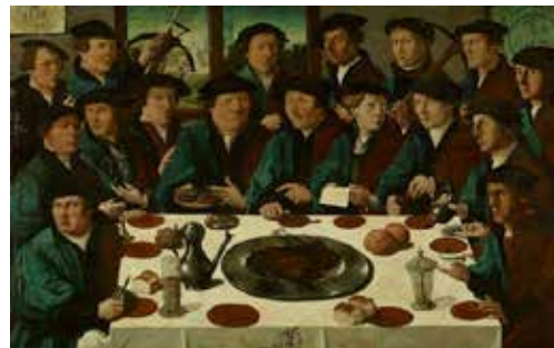
Fig. 15 Cornelis Anthonisz, Banquet of Seventeen Members of the Crossbowmen's Civic Guard , known as The Braspenningmaaltijd ( Banquet of the Copper Coin ), 1533, oil on panel, 130 x 206.5 cm. Amsterdam Museum, Amsterdam, inv. no. SA 7279 (Artwork in the public domain; photograph provided by Amsterdam Museum).