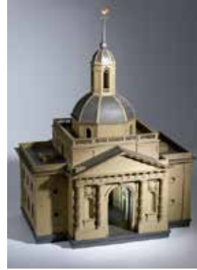
Fig. 3 C. Rauws, Model of the Muiderpoort , wood, paint, and metals, 151 x 115 x 80.5 cm. Amsterdam Museum, Amsterdam, inv. no. KA 7477 (Artwork in the public domain; photograph provided by Amsterdam Museum).