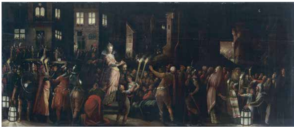
Fig. 2 Gillis Coignet I, Judith showing Holofernes's head to the people of Bethulia , 1586-1594, oil on panel, 62.5 x 149 cm. Musée des Beaux-Arts, Caen, inv. no. 2000.3.1 (artwork in the public domain)