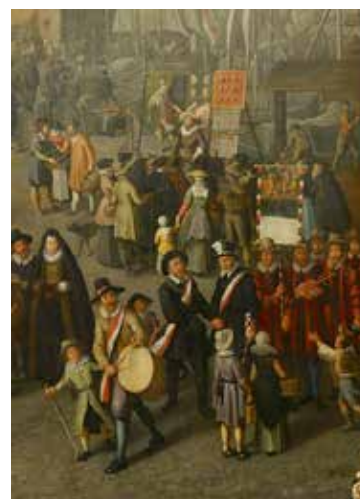
Fig. 9b Detail of figure 8a.