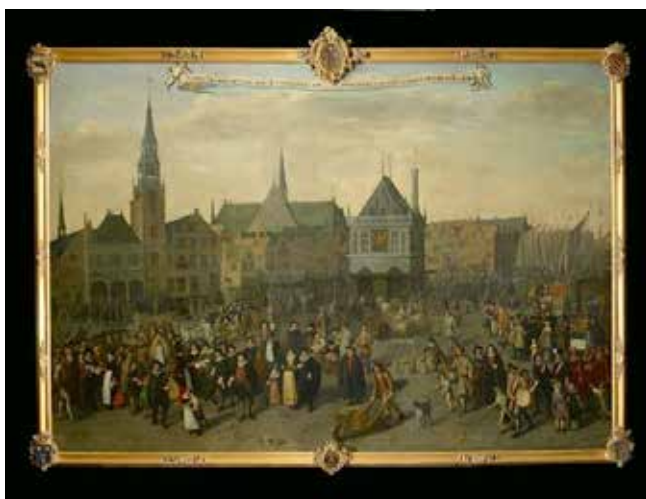
Fig. 9a Adriaen van Nieulandt, Dam Square with the Lepers' Parade , 1633, oil on canvas, 212 x 308 cm. Historisch Museum, Amsterdam, inv. no. SA 3026. Image: Amsterdams Historisch Museum (artwork in the public domain)