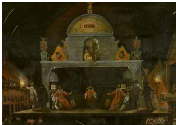
Fig. 6 Detail of figure 1. Image: Amsterdams Historisch Museum (artwork in the public domain)

6 On stage, several well-dressed men appear in the half darkness. Among them likely number the governors of the Dolhuis, the clerks who are administering the lottery, and the inspectors who ensure a flawless procedure. The two gentlemen looking down on the drawing from the round holes above are probably inspectors as well. The rules required that the controlling representatives of the city government (bailiff, burgomasters, sheriffs, and the thirty-six councillors) each take a turn providing oversight and be replaced every three hours. 14 These individuals were assisted by a former sheriff and a governor of one of the almshouses. On the left side of the stage, a man climbs a ladder. Will he replace the man, visible at the back, who waits and looks straight toward