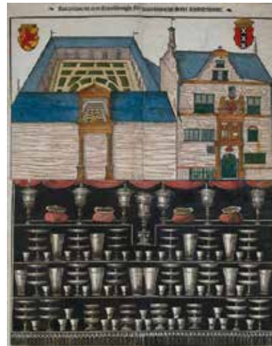
Fig. 4 Herman Jansz Muller, Lottery , 1591, colored woodcut, 74 x 58,5 cm. Rijksmuseum, Amsterdam.