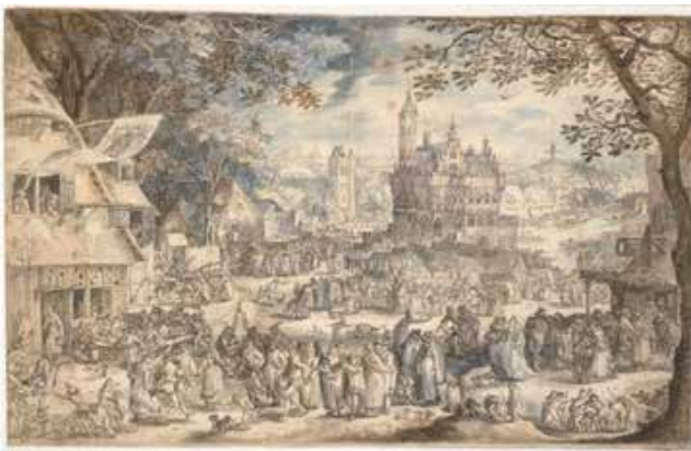
Fig. 8 David Vinckboons, Village Kermis , 1602, pen and ink, 45 x 71,1 cm. Statens Museum for Kunst, Copenhagen, inv. no. KKSgb5209 (artwork in the public domain)

11 Paintings showing current events like this lottery representation are extremely rare in Netherlandish art. Yet a fairly large group of sixteenth-century Flemish prints does describe such major historical festivities as processions and the triumphal entries of rulers; and two prints after Pieter Breughel the Elder depict Antwerp kermises that took place around 1558-59. 28 These scenes act as a prelude to the painted genre of the village kermis that flourished in the early seventeenth century, until about 1630. 29 No doubt because of their familiarity with the prints, the artists who contributed to the genre in painting hailed from Flanders. Depictions of charity events in any medium were exceptional, however. In a village kermis scene by David Vinckboons, known from an authentic drawing dated 1602 (fig. 8) and from at least twelve painted studio versions, what might be a lottery can be discerned in the background. 30 According to van Mander's life of the artist, Vinckboons devoted a full painting to the subject of a nighttime lottery in 1603. Now lost, the painting was then in the brand new Amsterdam Oude Mannen- en -Vrouwen Gasthuis (Old Men's and Women's Hospital). 31 Vinckboons must have known Coignet's older example, which was installed just a few blocks away. Nevertheless, of these two Flemish immigrants to Amsterdam, only Coignet was praised by the biographer for his night scenes, a skill that must have prompted the Dolhuis governors to approach him for the job. 32