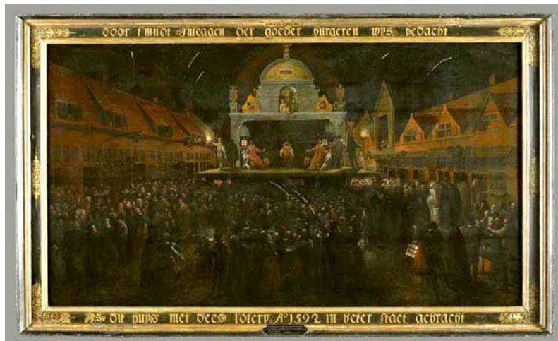
Fig. 1 Gillis Coignet I (ca. 1542-1599), The Drawing of the Lottery of 1592 for the Amsterdam Madhouse (Dolhuis), 1593, oil on panel, 113 x 203.5 cm. Historisch Museum, Amsterdam, inv. no. SA 3019. Signed and dated at the bottom, left of center: "G coingnet fe. / in mey 1593."

In 1592, the Flemish artist Gillis Coignet I (ca.1542-1599) produced a highly unusual painting for the Amsterdam Dolhuis (Madhouse) representing a nocturnal lottery organized to support the expansion of the building. This article investigates the iconography of the painting in relation to the historical circumstances surrounding this lengthy lottery (68 days and nights). It also places the painting in the context of (rare) depictions of current events. DOI: 10.5092/jhna.2010.2.1.4