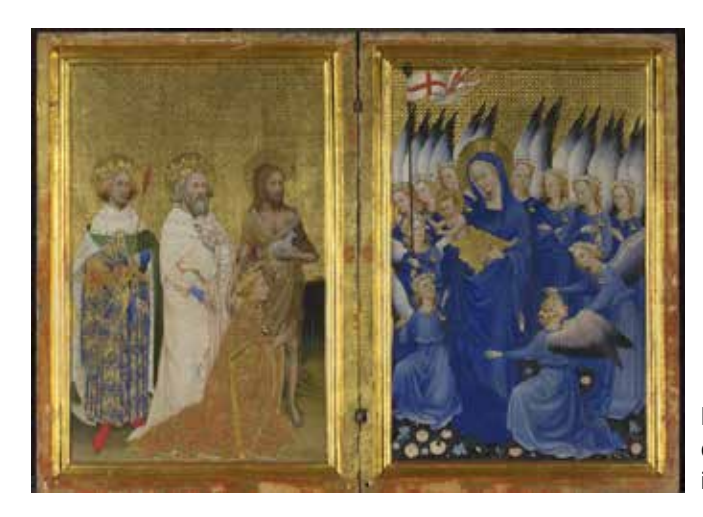
Fig. 3 Anonymous, Wilton Diptych, ca. 1395-99, oil on panel, 53 x 37 cm. National Gallery, London, inv. no. NG4451 (artwork in the public domain)

Panofsky described the donor portrait in the Rolin Madonna as depicting, "a human being 8 [who] has gained admission to the elevated throne room of the Madonna without the benefit of a canonized sponsor," asserting that the chancellor had inappropriately insinuated himself into a holy space.<sup>22</sup> Subsequent scholars have attempted to determine the location depicted within the painting, celestial or terrestrial, and the power of Panofsky's words has influenced numerous interpretations.<sup>23</sup> It is important to approach the painting objectively in order to understand the formal and iconographic elements without the overlay of unquestioned aspersions on the donor's character. Because they were looking for visual proof of Rolin's rotten character, most scholars have misunderstood what is actually portrayed. Rather than an image of unparalleled hubris, in actuality the formal elements of the painting differ only slightly from numerous images of donors with holy figures that preceded it.<sup>24</sup> Rolin's placement in the painting is no more shocking or hubristic than that of Jean de Berry in the Brussels Hours or Richard II in the Wilton Diptych (London, National Gallery; fig. 3). In fact, Rolin commissioned the same type of portrait made for the nobles with whom he worked but, because he was not of noble birth, his emulation of these men may have helped tarnish his reputation in their eyes.