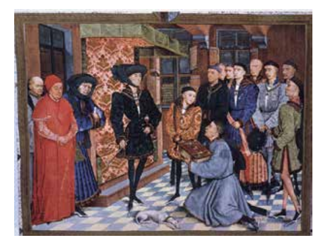
Fig. 4 Philip III the Good, Duke of Burgundy, Receiving a Manuscript , dedication page, Chroniques de Hainault , 1468, 43.9 x 31.6 cm. Bibliothéque royale Albert I, Brussels, inv. no. Ms. 9243 (artwork in the public domain)

4). Rolin is shown here wearing his customary chaperon with a long cornette that wraps around the hat and over his head. The large purse at the end of a low belt acts as a symbol of his office and, in a floor-length garment, he cuts a more somber figure than the elegant duke in his fashionably short tunic.<sup>50</sup> Rolin is depicted with slightly stooped posture showing his obeisance to the duke beside him.