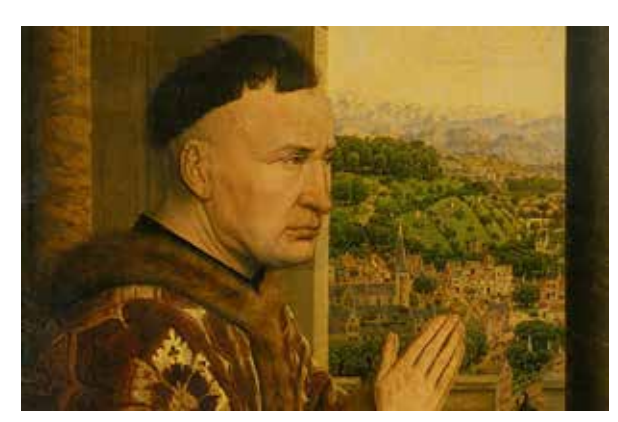
Fig. 7 Jan van Eyck, detail from Madonna of Chancellor Rolin (figure 1)

Forcefully connecting Rolin and his landscape with the Virgin and Child, Van Eyck's painting uses foreshortened perspective to push areas of the background into the foreground. John L. Ward noted that because of this effect the tips of the Christ Child's fingers in the foreground seem to connect to the bridge over the river in the distance. The deliberate compression of space makes it look as if Christ's gesture begins in the foreground but is carried through the background and arcs over the distant river, literally bridging the divide between the Virgin and Child's side of the landscape and that of Rolin. Once the viewer becomes aware of this deliberate manipulation of our perception of space within the painting we naturally look for additional examples. Yet this manipulation does not necessarily reflect a hubristic view, rather, it follows long-accepted schemes for the presentation of donors.