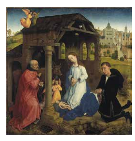
Fig. 9 Rogier van der Weyden, Nativity with the Donor Pieter Bladelin , center panel of the Middleburg (Bladelin) Altarpiece, ca. 1445, oil on panel, 91 x 89 cm. Gemäldegalerie, Staatliche Museen zu Berlin, Berlin, inv. no. Nr. 535 (artwork in the public domain)

ing as possible. The Virgin looks toward him and the Christ Child blesses him, but there is no real interaction. Most importantly, a clear vertical line, like the crease in a book or the hinged frame of a diptych, separates these figures. <sup>97</sup> Rolin and the Virgin and Child share the same imaginary space, but they should not be seen as actually inhabiting this space together.