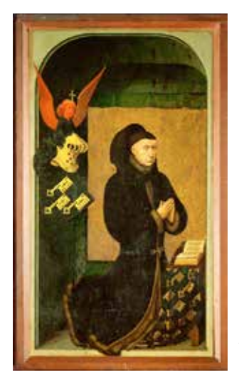
Fig. 2 Rogier van der Weyden, Nicolas Rolin, chancellor for the dukes of Burgundy , reverse panel from the Last Judgment , 1434, oil on panel, Beaune, France, Hôtel-Dieu, inv. no. 135 (artwork in the public domain)