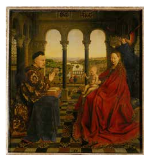
Fig. 1 Jan van Eyck, Madonna of Chancellor Rolin , ca. 1435, oil on panel, 66 x 62 cm. Musée du Louvre, Paris, inv. no. 1271 (artwork in the public domain)

"Cultural acts, the construction, apprehension, and utilization of symbolic forms, are social events like any other; they are as public as a marriage and as observable as agriculture." Clifford Geertz, "Religion as a Cultural System"