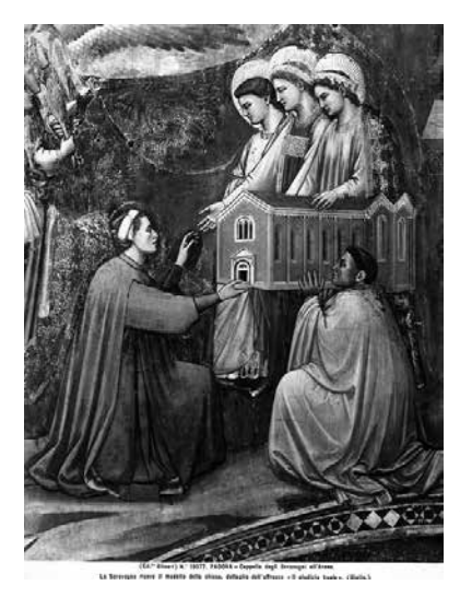
Fig. 8 Giotto di Bondone, detail with Enrico degli Scrovegni from the Last Judgment , 1305, fresco. Scrovegni Chapel, Padua (artwork in the public domain)

One of the most obvious of these spatial conflations is the church located just above Rolin's joined hands, discussed above, which looks as if it is resting on the chancellor's hands. This placement recalls archetypal donor images, such as Giotto's famous donor portrait of Enrico Scrovegni in the Arena Chapel, shown presenting his chapel to three saints (fig. 8).<sup>89</sup>